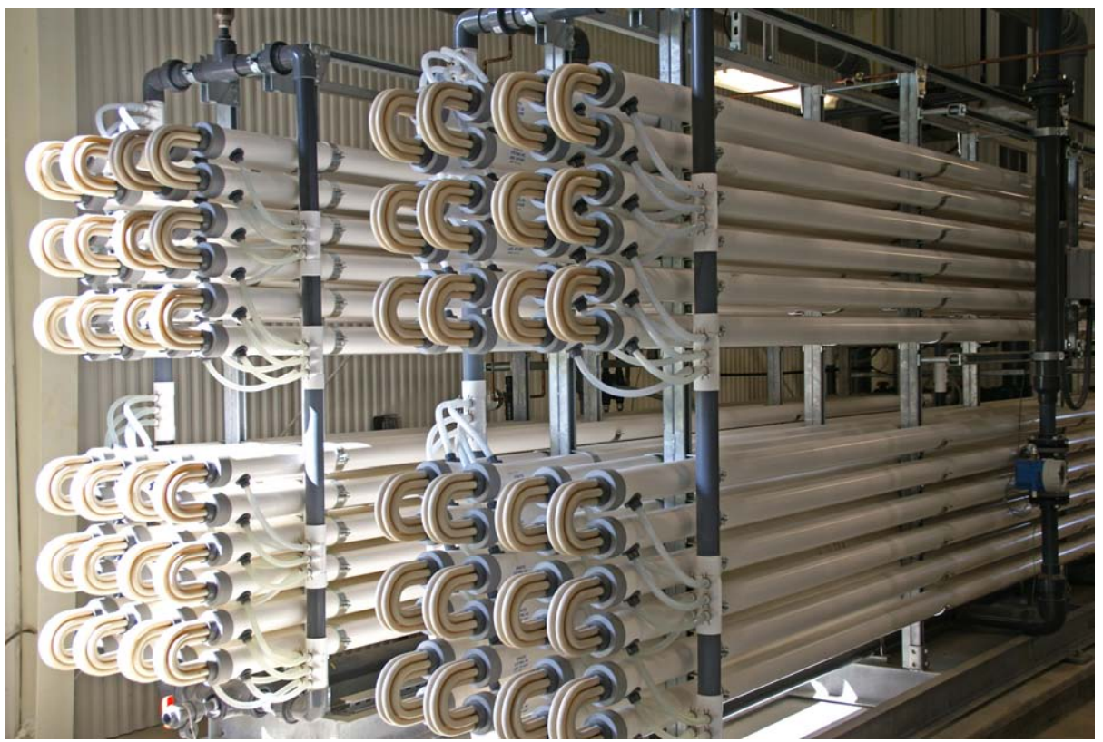
Figure 4. Battery of the UF Membranes