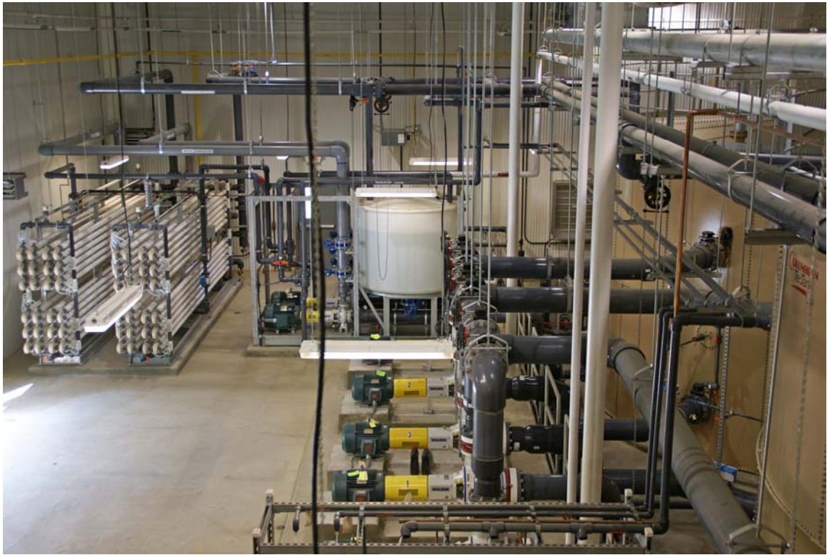
Figure 2. General View of the MBR Facility

The design MLSS concentration range was specified as 10,000 to 15,000 mg/L. The raw leachate is pumped to a single, 80,000 gallon (approximate working volume) anoxic tank mixed with a submerged jet mixing system, where it is combined with mixed liquor returned from the membrane reject (Figure 3). Partially denitrified effluent is split and flows by gravity to twin, 60,000 gallon aerobic tanks (approximate working volume) with jet aeration systems. With the overall working system volume of approximately 200,000 gallons, the design average F/M of the system at 10,000 mg/L of MLSS is 0.04 #COD/#MLSS-day (including anoxic volume).