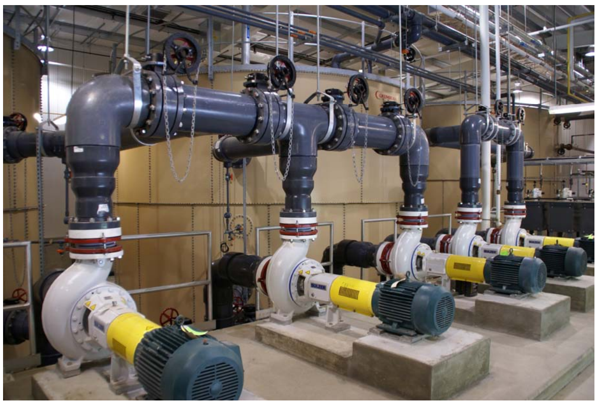
Figure 3. Reaction Tanks and Aeration/Mixing Systems

The mixed liquor is separated from the effluent by a battery of membrane filtration (ultrafiltration) units. Two independent, pre-engineered membrane systems, each with a capacity of 50,000 gpd, were provided. Normally, only one system is expected to be on line. Each system consists of 48 tubular, cross-flow membranes, mounted in eight (8) parallel modules, each with six passes (six (6) membranes in each module) (see Figure 4). An individual membrane consists of a 3\frac{1}{2} - inch diameter PVC pipe, in which seven (7) individual ultrafiltration tubes are housed. The mixed liquor is pumped at a high surface velocity across the membranes using a 580 gpm (16.7 times forward flow), high pressure pump. The reject stream is divided between the suction side of the membrane feed pumps with the balance returned to the aerobic and anoxic tanks. In-place membrane cleaning system with acid is provided.